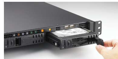
Dual front-accessible SATA HDD trays